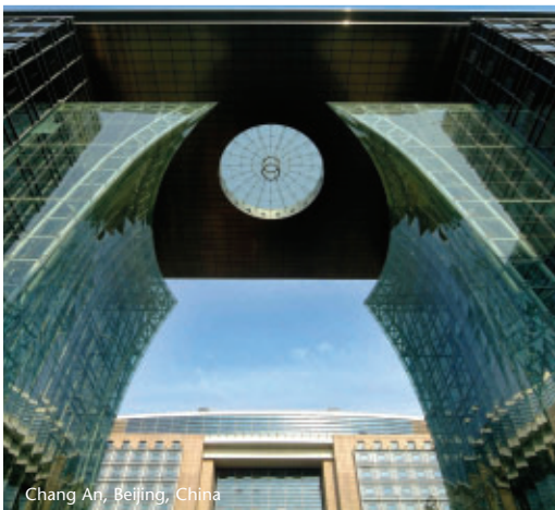
Chang An, Beijing, China