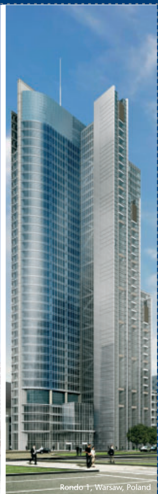
Rondo 1, Warsaw, Poland