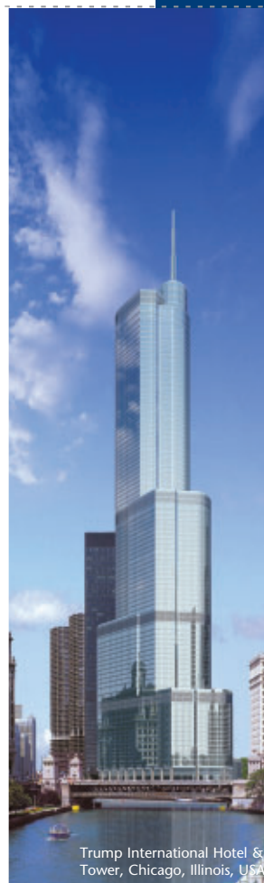
Trump International Hotel & Tower, Chicago, Illinois, USA