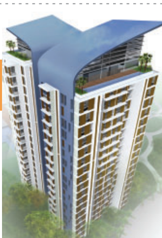
Prestige Shantiniketan, Bangalore, India