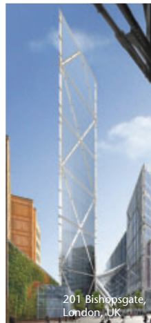
201 Bishopsgate, London, UK

For new construction or modernisation, Lerch Bates consultants are welcome members of the architectural design team because we bring a multiple discipline approach. We are current with today's architecture and the latest technology and we optimise system design for the benefit of our clients. Additionally, clients benefit from our 60+ year reputation as an innovator and industry leader. We provide continuing education for architects and serve as a regular sounding board for lift equipment manufacturers on trends and issues. We are a key industry resource.